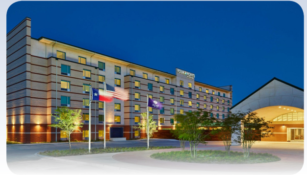
Four Points by Sheraton Dallas Fort Worth Airport North

We're looking forward to seeing you on Friday, October 23rd (All Day) and Saturday, October 24th, 2020 until noon for two great days of learning, planning and idea exchange! Below are a few details to help you prepare for your trip: